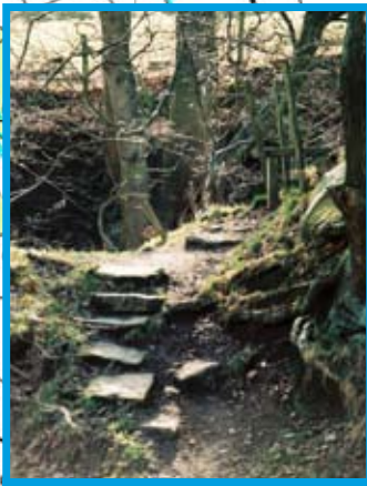
Stone steps by Stubb Clough.

Long Lane: before Hollin Hey track, turn right over stile; down Long Lane - to Top Land Country Business Park. Cross both access roads, then bear right, through top of woods, with business park on your right, and Cragg Brook below on your left. Stubbings Close brings you back down to Mytholmroyd.