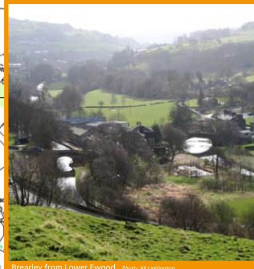
Brearley from Lower Ewood.