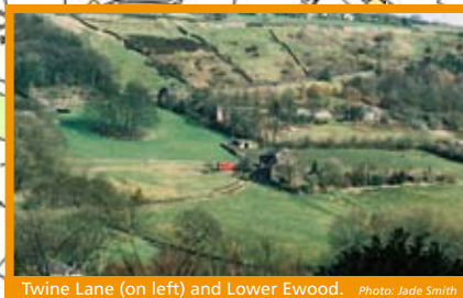
Twine Lane (on left) and Lower Ewood.