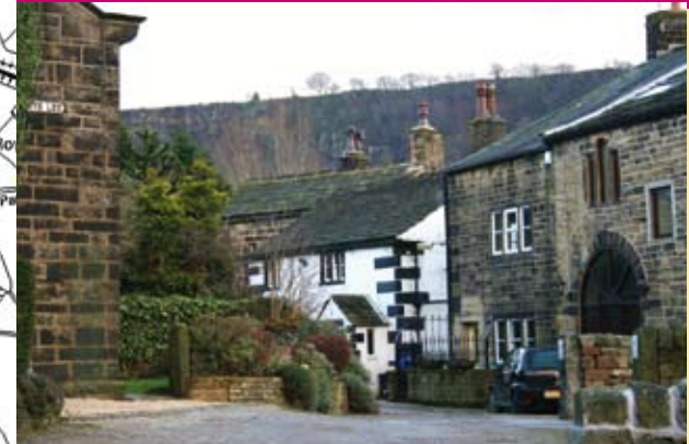
White Lee, with its early eighteenth-century buildings and small courtyard, is one of the oldest hamlets in Mytholmroyd.