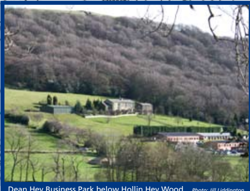
Dean Hey Business Park below Hollin Hey Wood.